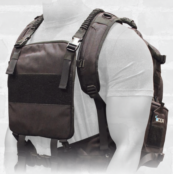
Armor not included.