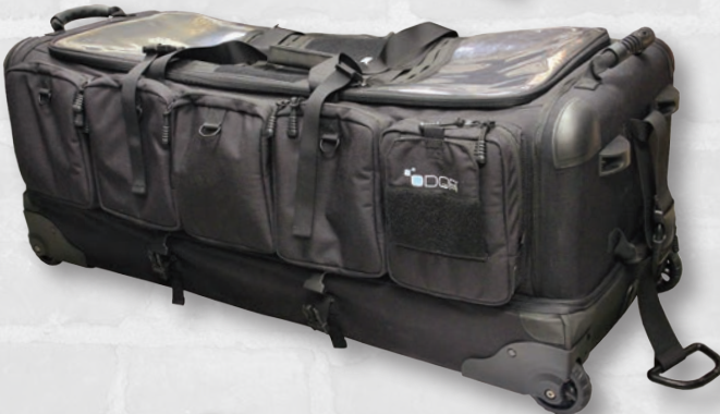
ROLLING GUN CASE TRANSPORT